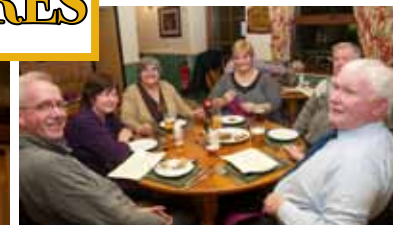
Friends, family, and invited guests enjoy Taster Evening